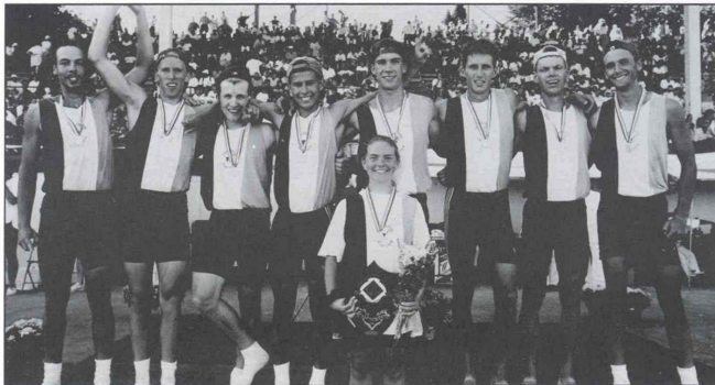
WYANDOTTE'S FAVORITE HENLEY EVENT, THE SENIOR 140-POUND EIGHT

When you return to your team next season, you will be a much better oarsman or oarswoman. The coaching, the experience, and the strength you will gain by rowing for the WBC this summer WILL translate to more medals and faster boats.